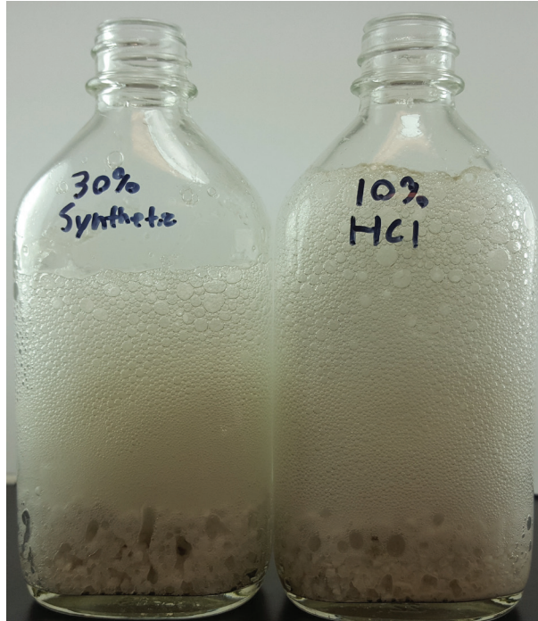
Reaction of 30% ProReact Acid compared to 10% HCl Acid

ProReact Acid is an alternative to traditional hydrochloric and organic acids used in oilfield stimulations such as matrix treatment and fracturing. Compared to traditional hydrochloric acid, this synthetic acid is less volatile and has low reactivity to metals, so there is less corrosion. ProReact Acid reacts slower than hydrochloric acid and can penetrate deeper into the formation. Trican also enhances ProReact Acid with additives to ensure compatibility between the formation fluid and the acid blend.